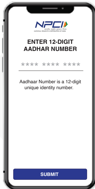
Input Aadhaar on NPCI secure page (SDK)