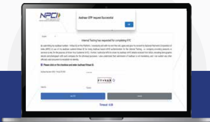
Provide Consent & Aadhaar No.