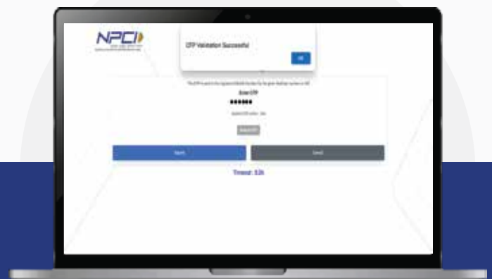
Input OTP & Submit for KYC completion